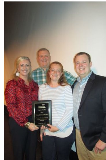
Nonprofit of the Year-YoungLife on the Pamlico