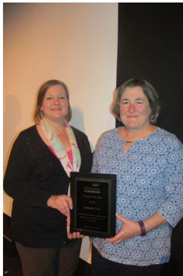
Nonprofit of the Year-Optimist Club